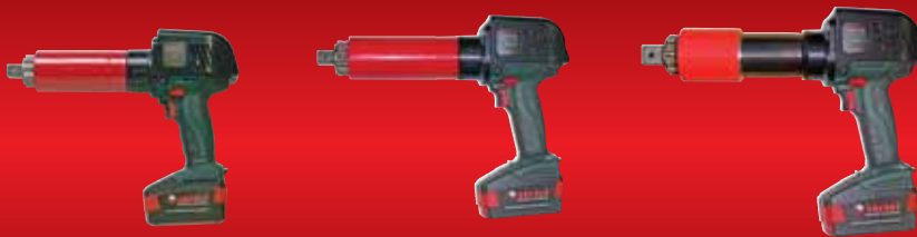
DB RAD® 500